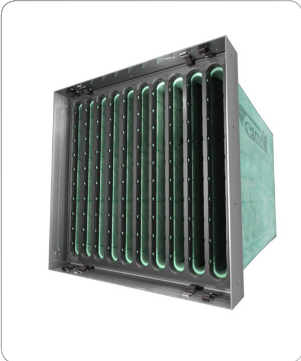
Hi-Flo® ES Filter not included.

Simplifies filter change by eliminating clips and fasteners, reducing filter replacement labor and time.